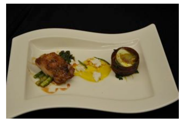
Kevin Bui - Hot Foods