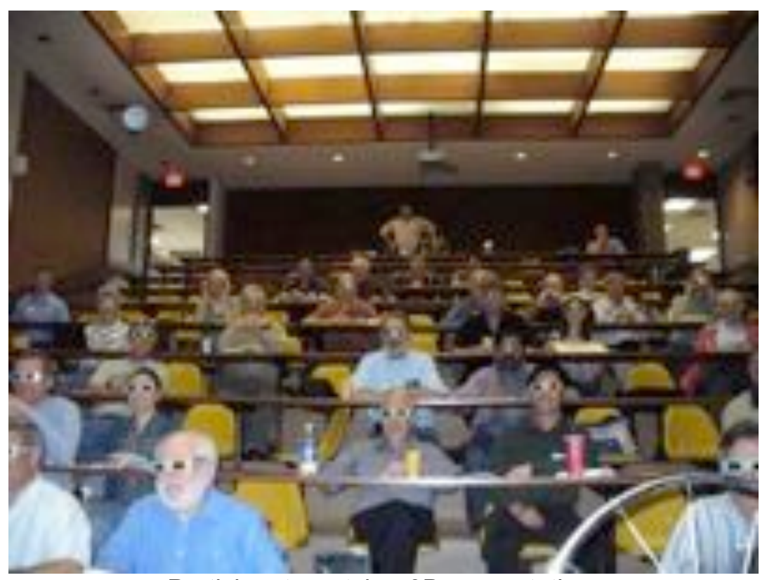
Participants watch a 3D presentation.