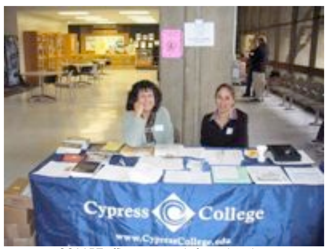
SCAAPT officers are ready for registration.