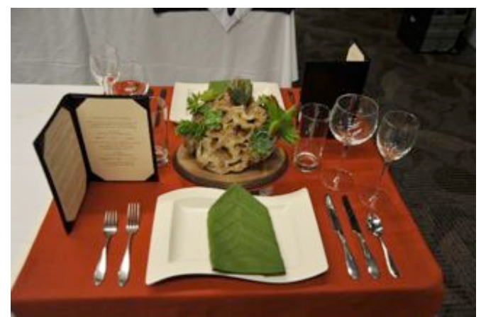
Chelsea Clapper – Tablescape