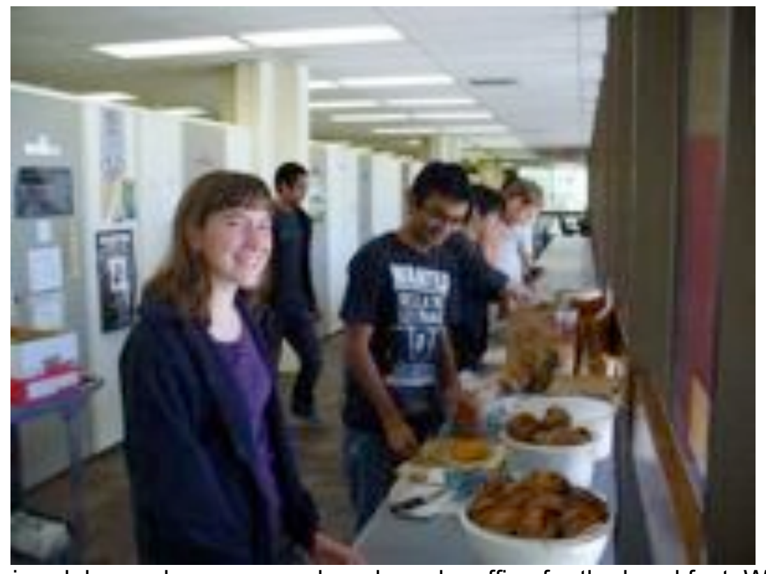
Engineering and Physics club members prepare bagels and muffins for the breakfast. We couldn't have done it without you!