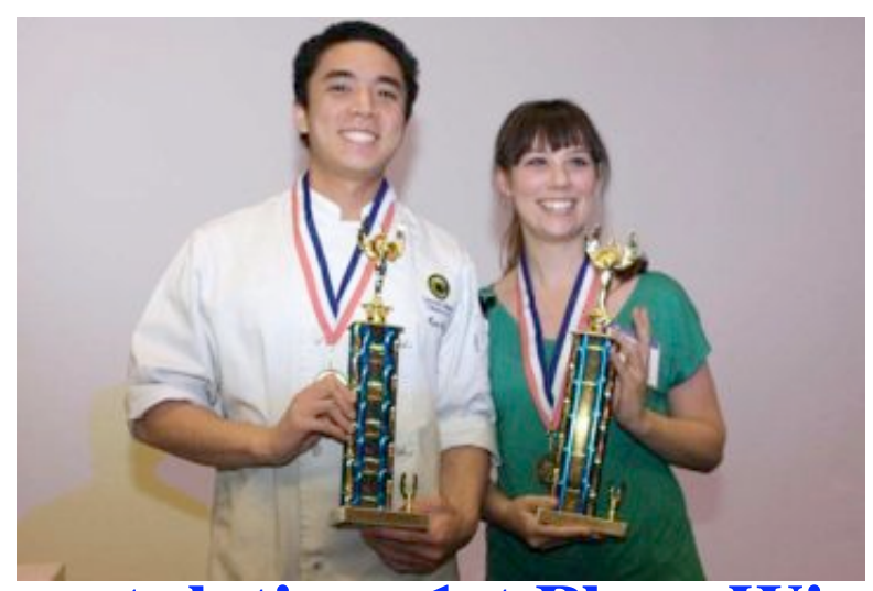
Congratulations 1st Place Winners California Community College Competition and Symposium 2010