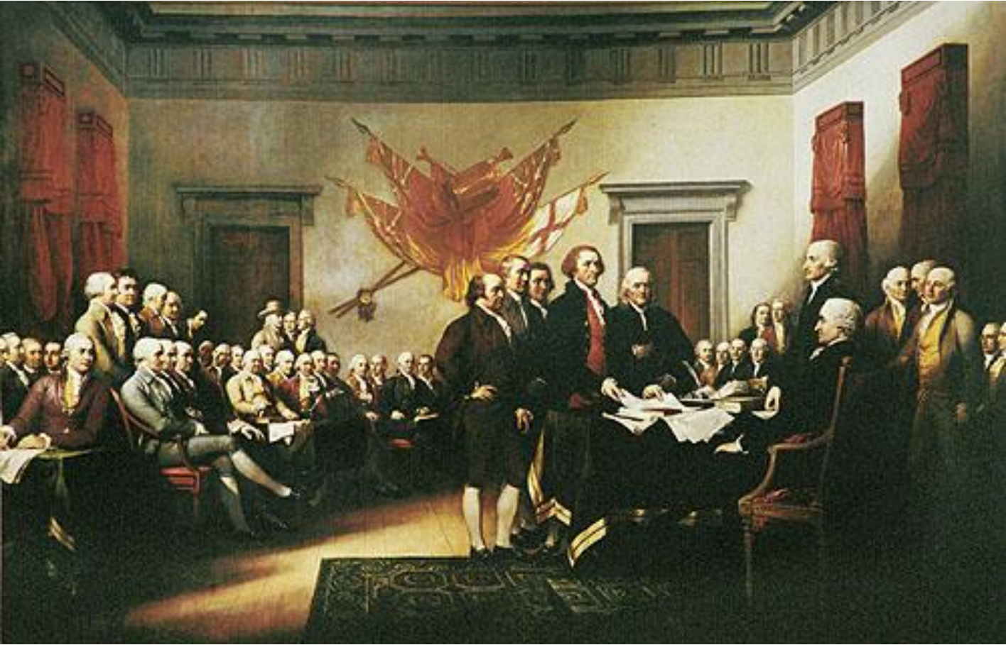
Commissioned 1817; purchased 1819; placed 1826 in the Rotunda