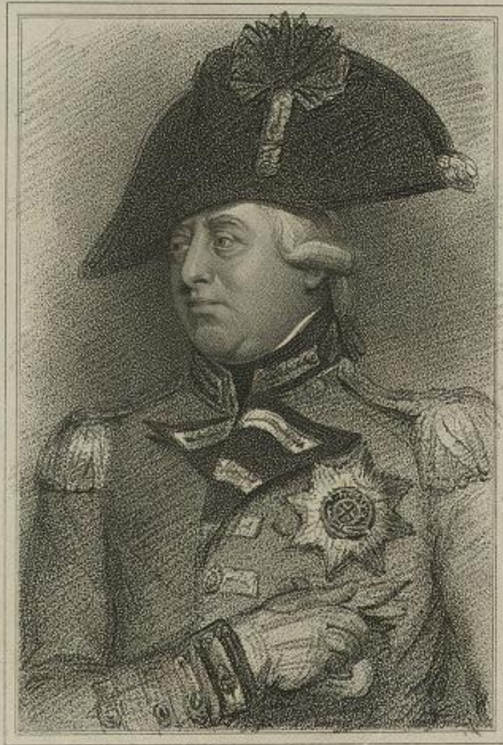
His Majesty GEORGE THE THIRD.