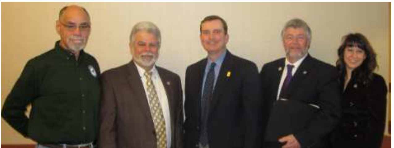
NYSBOC President, 1st VP and 2nd VP along with ICC