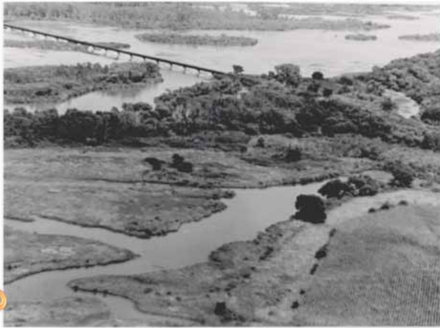
Photo above: Undated picture of the Chicago & North Western railroad built in 1886 crossing the Platte River @ Cedar Bluffs. This railroad was used for almost 100 years.

Photo below: Current Google picture of the Platte River is just East of Cedar Lakes.