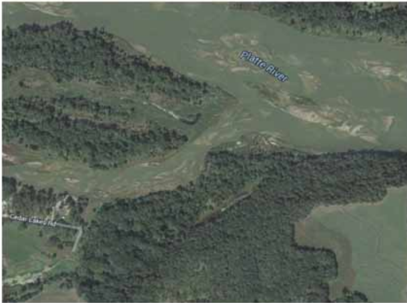
Photo below: Current Google picture of the Platte River is just East of Cedar Lakes.

Submit your old photos: old bridges, old boats or those old glory days of fishing or hunting on a Nebraska river. Include details of your photo. Pictures will be added to newsletters throughout the year.