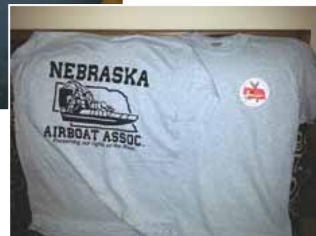
Heather Gray T-Shirt