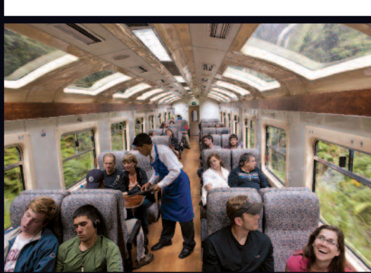
Above: Scenic train ride through the Sacred Valley to Aguas Calientes

Machu Picchu, hike part of the Inca Trail or explore the hotel's tea plantation and natural areas.