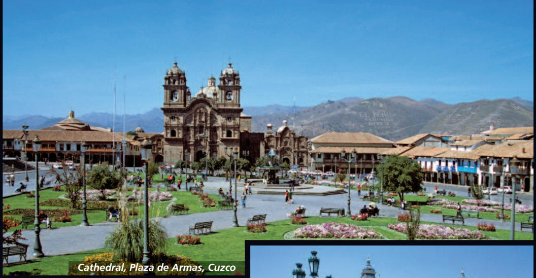
Cathedral, Plaza de Armas, Cuzco