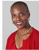
The Honorable Deborah A. Jackson, Mayor City of Lithonia, Georgia