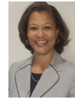
Carmen Chubb Deputy Commissioner Georgia Department of Community Affairs