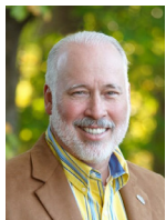
The Honorable Bucky Johnson, Mayor City of Norcross, Georgia