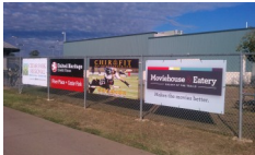
Banner advertising provides GREAT visibility!