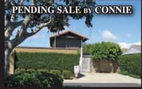
23781 PERTH BAY