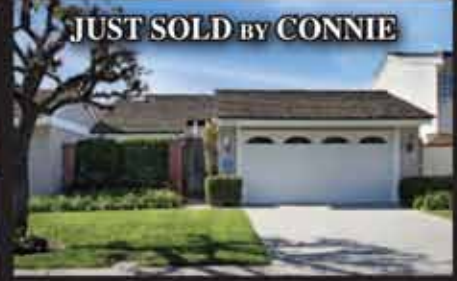
33615 CAPSTAN DRIVE