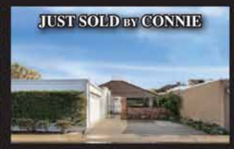
23812 SALVADOR BAY