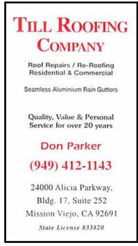
NSCA is not responsible for any work done nor are we recommending any of the advertised companies

Following the guided tour, members and their guests moved on to the famous Farmer's Market adjacent to CBS Studio City for lunch, where they partook of a wide variety of cuisines, and enjoyed the lovely weather This