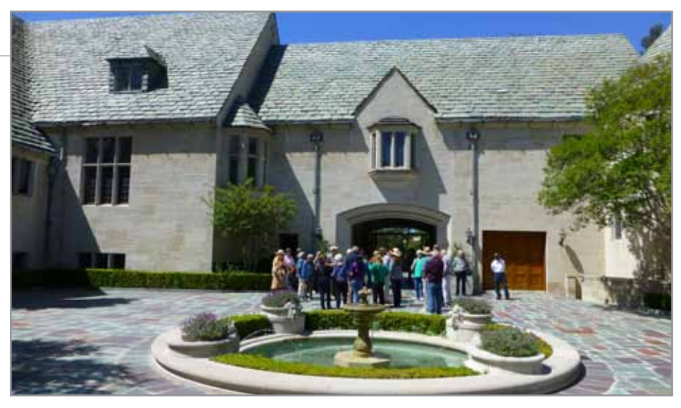
Garden Club Members visiting Greystone Mansion, April 2013

was finished up with a relaxing snooze on the trip home.