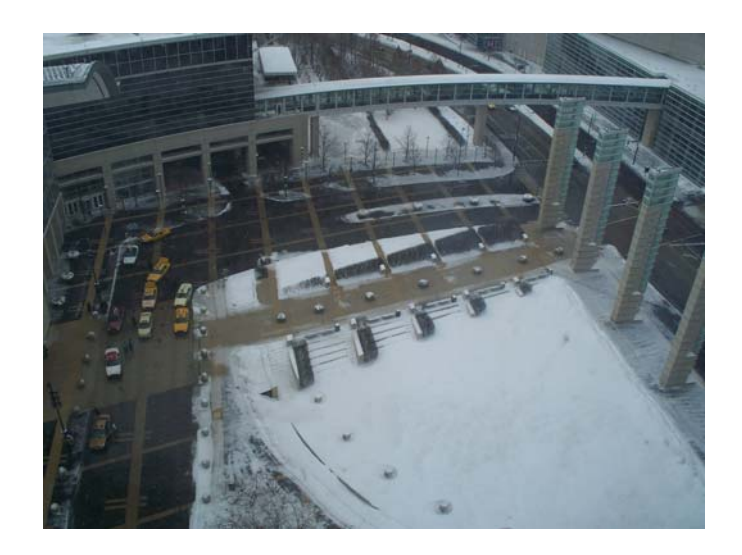
McCormick from 19 Stories Up

construction throughout the United States. ASHRAE publishes a revised version of the standard every three years. The 2007 version of Standard 90.1 was released last year.