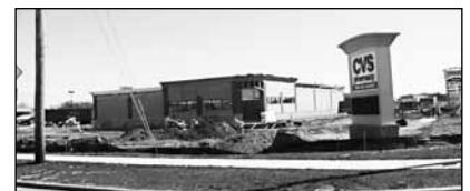
CVS Pharmacy/Minute Clinic: 7292 Fulton Drive NW