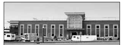
Mercy Medical Center: 7337 Caritas NW