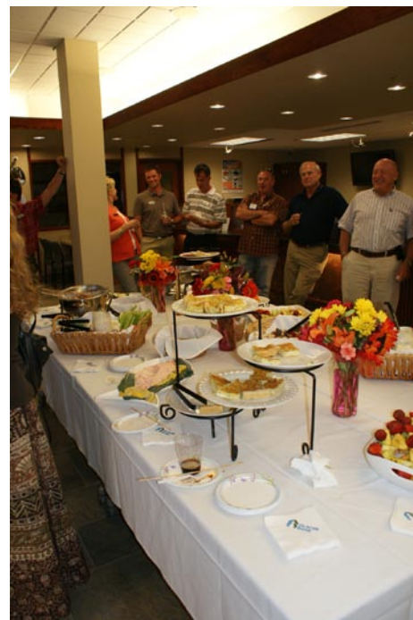
Enticing goodies on the food table