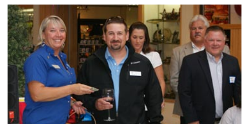
Drawing the winner!

Sykes 202 2nd Avenue W # 2 Kalispell, MT