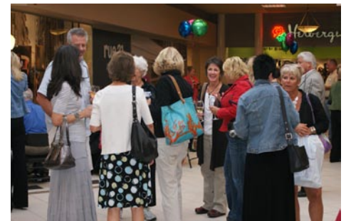
Attendees at the Kalispell Center Mall 25th Anniversary UNWIND