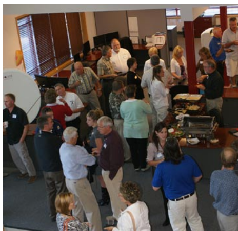
Attendees networking while waiting for a tour of the Nomad facility