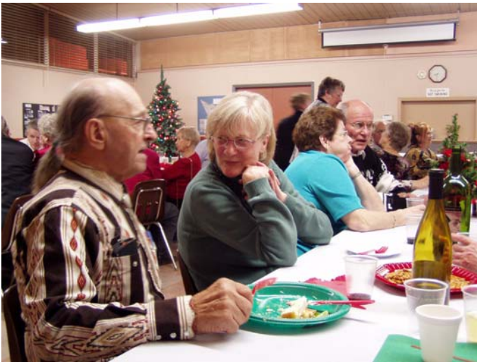
A couple more deep discussions