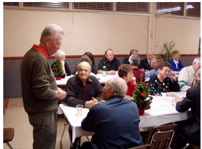
Ross giving a lecture