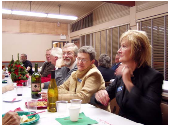
Watching the other side of the table