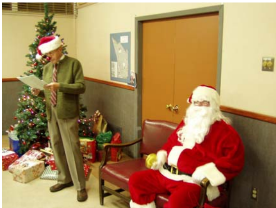
Santa and his little helper