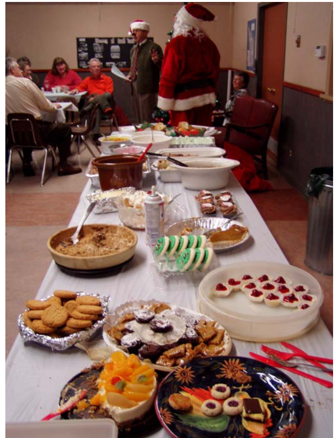
Some of the goodies

A very special thank you to Santa Claus who arrived with gifts for everyone and had great fun handing out "special" gifts for the Model T misadventures during the past touring season.