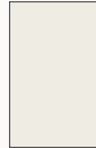
Rectangle INVC 5" x 7.875"