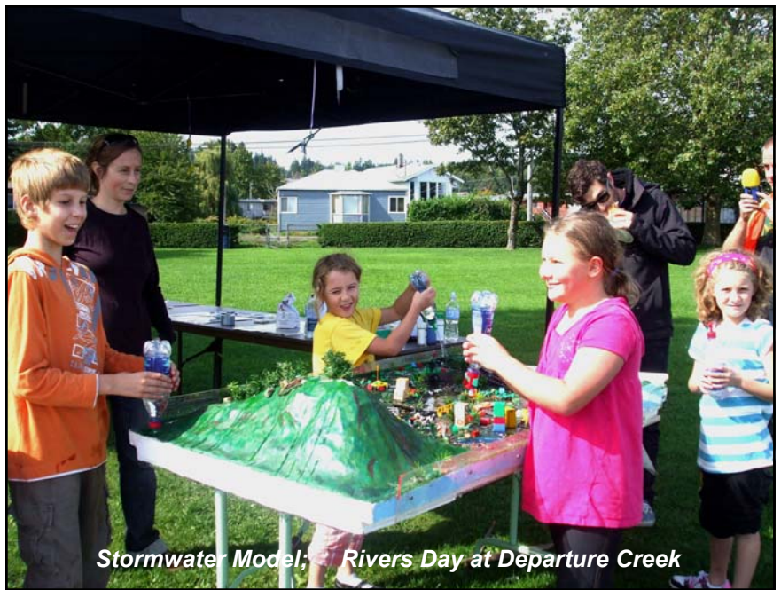
Stormwater Model; Rivers Day at Departure Creek

A door-to-door information drop to the residents of the Departure Bay area will be made in late October to notify residents about an evening information session. The meeting will be an opportunity for the community to learn more about Departure Creek; and to learn how to get more involved to enhance and monitor the creek and the riparian areas along its banks for the health of present and future fish populations.