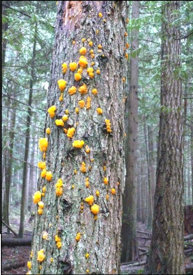
Witch's Butter (Tremella mesenterica)

The damp weather we have been enjoying is perfect for the appearance of Witch's Butter on decaying deciduous wood. The bright ( Tremella mesenterica ) yellow blobs brighten a dull day in the woods. Easy to find, fun to touch (they squiggle), and good to eat. You can even conjure up a spell and stir some into a cauldron of soup!