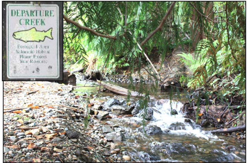
Enhanced Fish Channel, Departure Creek.