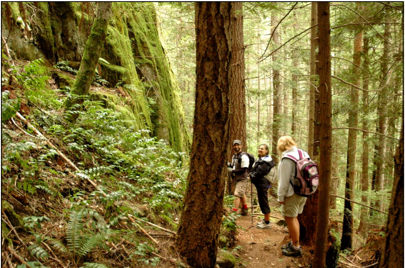
August 11—one of several guided hikes on Mount Benson