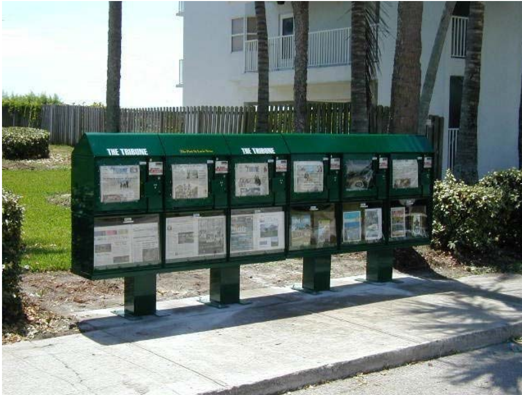
Approved news rack by Rak Systems, Inc.