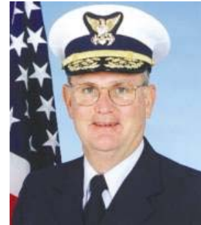
Admiral Thomas H. Collins

All three areas of emphasis will be important to meeting the challenges of the future, as we look forward to the coming days ahead. But the most important will be the emphasis on people .