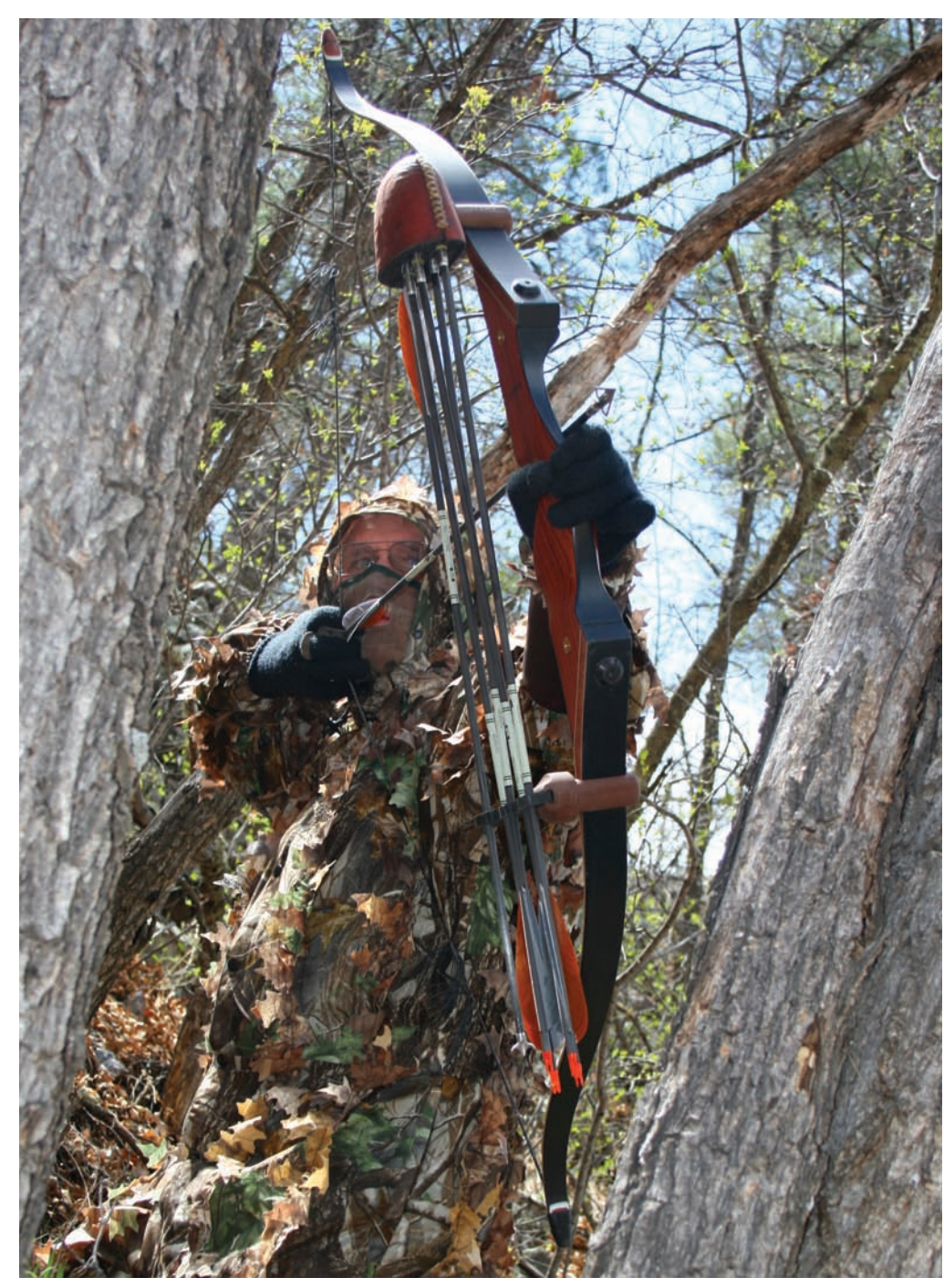
Whitewater Outdoors' 3D Realleaf Coverall allows the bowhunter to remain ready for action. It is a suit that can be worn over any attire to provide instant deployment of the ultimate camouflage.

Jacket sleeves and pant-leg openings include elastic cuffs, a patented Visor Pro Head Cover concealing and shading the eye area. It can be worn without a cap. The jacket includes a fully zippered front, drawstring waist and two front cargo