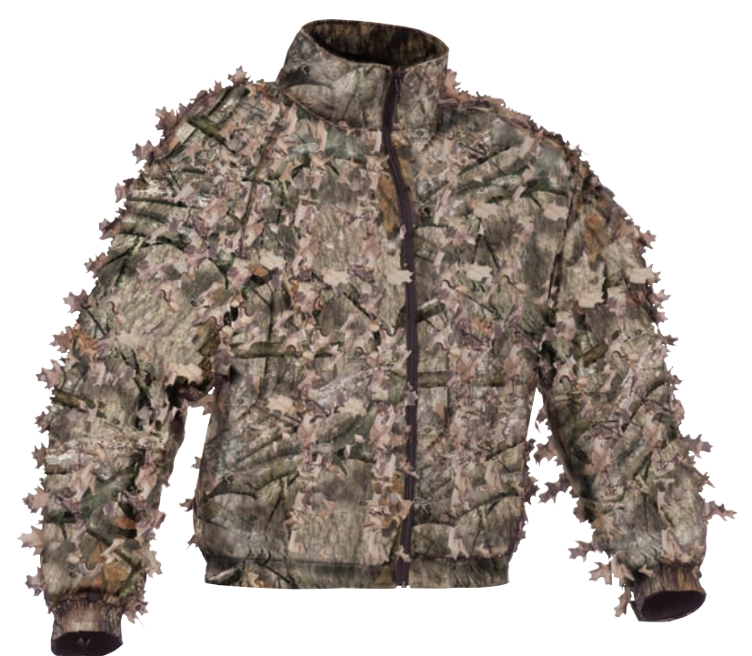
Robinson Outdoors' 3D Realleaf XLT wear keeps the bowhunter covered on many levels. Three-dimensional leaves give the bowhunter a concealment edge, while the ScentBlocker 30 SPF activated carbon provides a scent-containment advantage.

TrueTimber Camo uses Milliken leafy material to produce a suit shelled with military-grade mesh to be extremely durable. Milliken's exclusive intrigue leafy technology