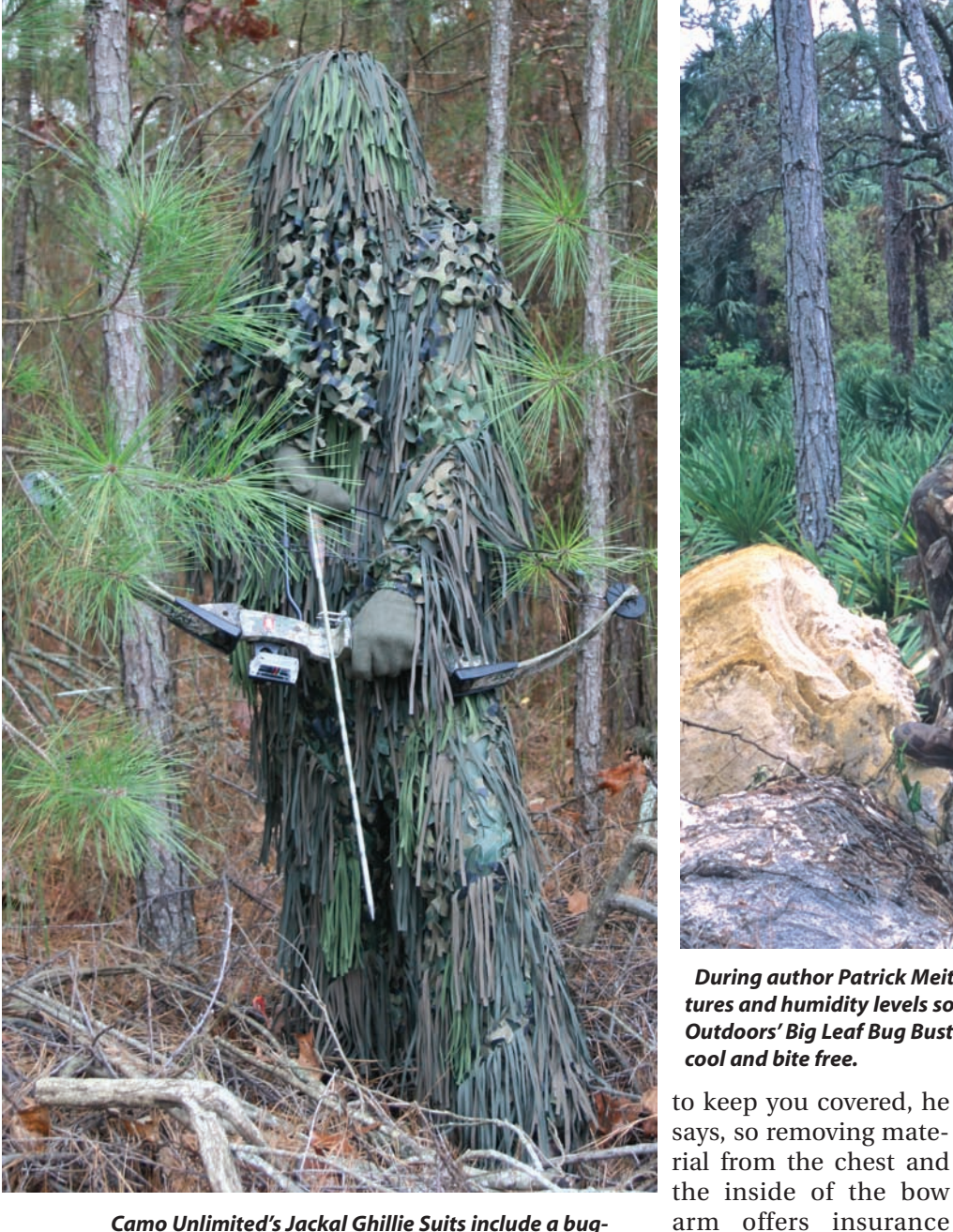
Camo Unlimited's Jackal Ghillie Suits include a bugproof liner for comfortable bowhunting during early seasons and scent-free, mildew-resistant material that is also bowhunting quiet.

back. Longer hanks of material provide further break up than leafy suits, concealment that customers take with them when cover is thin or nonexistent.