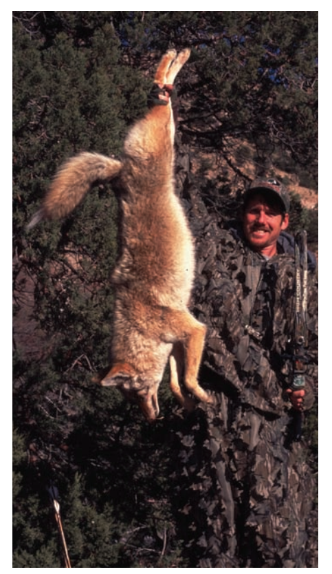
It was bowhunting predators that convinced the author of this article that 3-D camouflage was something extraordinary. Nothing's more wary than a coyote, and camo enhanced by 3-D gives a decided edge in bagging these crafty critters.

Rocky's hunter friendly and well made Leafy Collection includes Buzz Off Leafy jacket and pant that not only provides its insect-repelling protection, but 3-D camouflage concealment. They include Pongee leafy outer shell in a bomber-style jacket and 6-pocket pant. The jacket includes elasticized waist, full length front zipper and two-way cargo pocket. The six-pocket pant includes two scoop pockets, two side cargo pockets and two covered rear pockets, hidden elastic waist adjustments, comfort gusset and ribbon-tie leg openings. They are available in Mossy Oak Break-Up, sized M through 3XL.