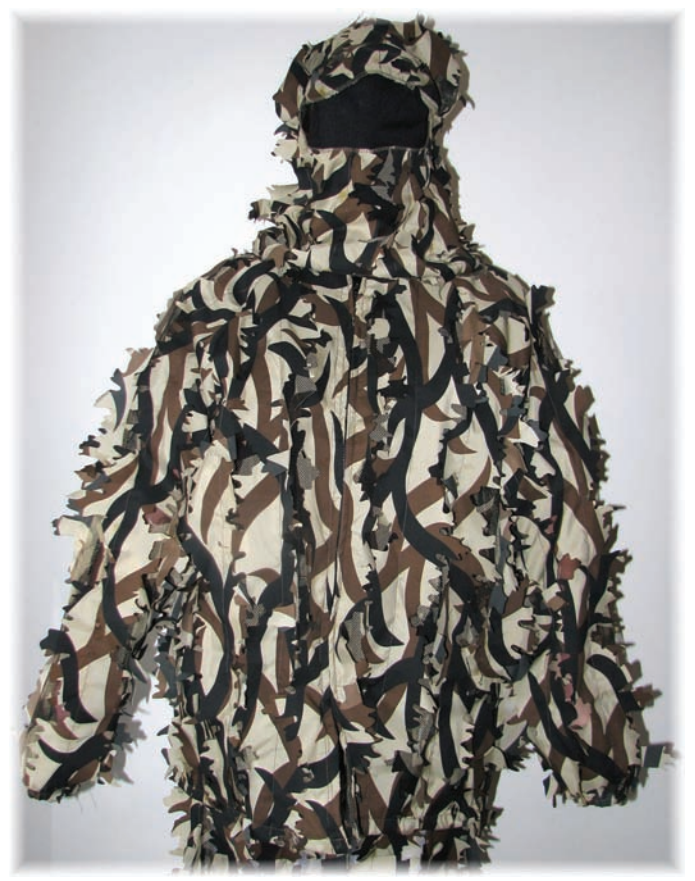
ASAT camouflage is one of the most effective patterns out there. Add it to a leafy, 3-D suit and its cloaking qualities are made that much better, perfect for the most demanding bowhunts.

sized S/M to fit ages 10 to 12 and L/XL to fit ages 14 to 16.