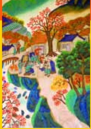
Peasant painting, Huxian