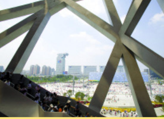
Far Left: Temple of Heaven, Beijing Left: View from inside the Bird's Nest, Beijing Lower left: Peking Opera actor, Beijing Below: T'ang dancer, Xi'an