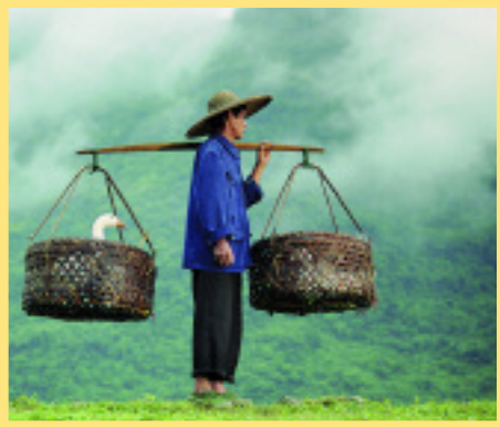
Upper left: Market, Shanghai Left: Farmer, Guilin Below: Three Gorges

Independent Exploration: Yangshuo . After disembarking, take time to explore this town on the banks of the Li River.