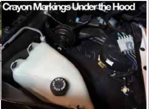
CRAYON MARKINGS UNDER THE HOOD