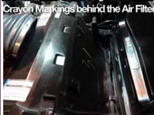
Crayon Markings behind the Air Filter