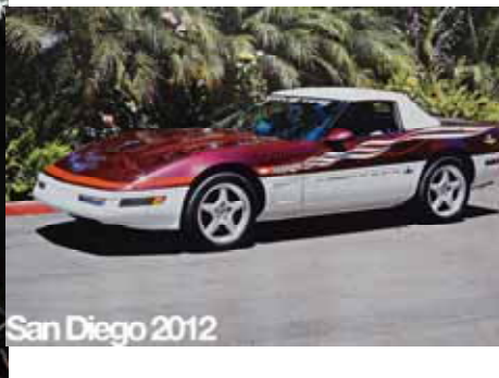
San Diego 2012