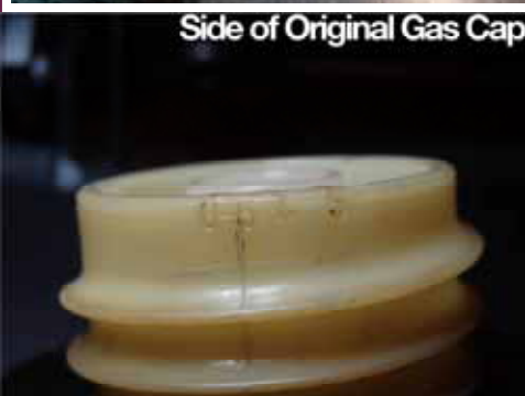
Side of Original Gas Cap