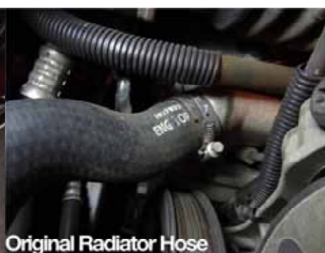
Original Radiator Hose