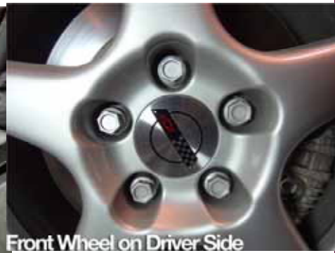
Front Wheel on Driver Side