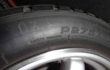
Build Number Stamped on Right Rear Tire