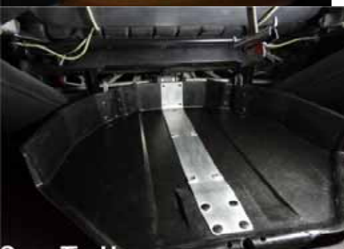
Spare Tire Hangar