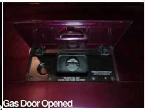
Gas Door Opened