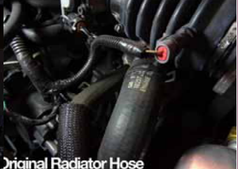
Original Radiator Hose