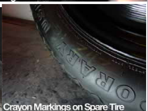
Crayon Markings on Spare Tire