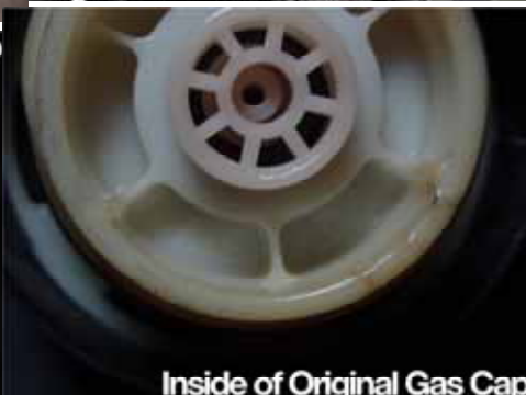
Inside of Original Gas Cap