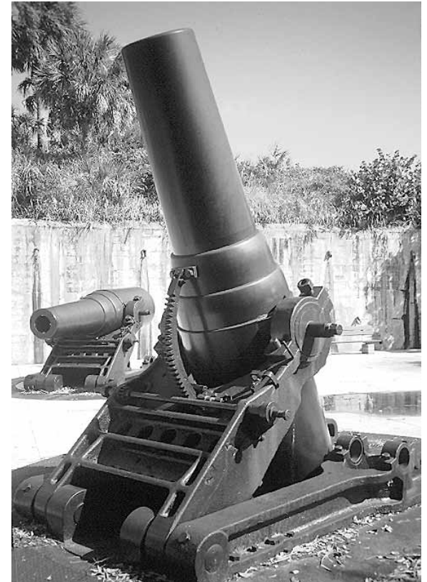
Two 12-inch Seacoast Artillery Mortars in Battery Laidley at Fort DeSoto County Park near St. Petersburg, Florida