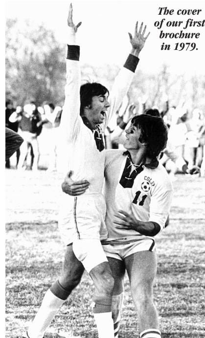
The cover of our first brochure in 1979.

Upon receipt of your application/deposit you will be mailed confirmation of a place at camp, as well as a bulletin with details of travel, clothing needed, health form and registration time and place.