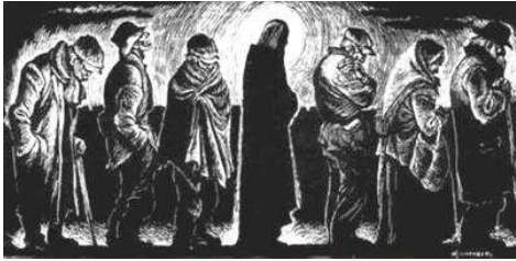
The Christ of the Breadlines ~ Fritz Eichenberg

ST. JOHN'S HOSPICE 1221 Race Street, Phila, PA 19147