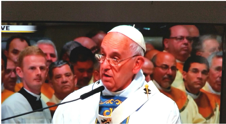
Everybody was watching