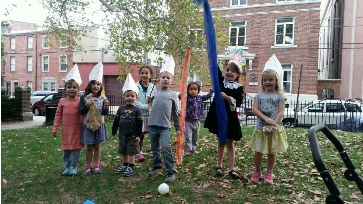
Children wearing bishop's mitres enjoy a pope party with their families in Mario Lanza