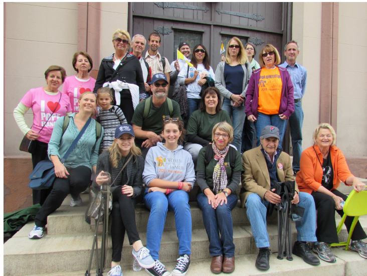
READY TO WALK