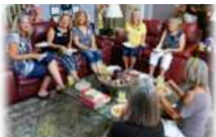
(Pictures from the 2012 Event)