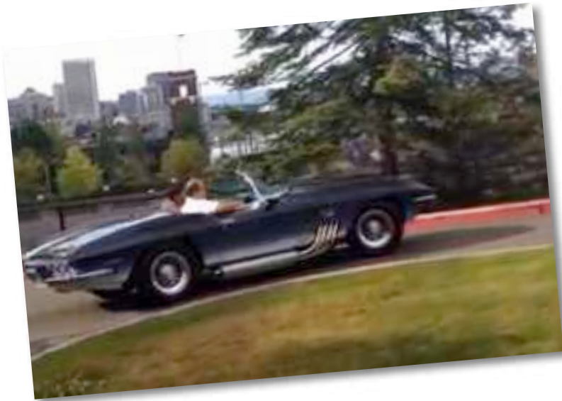
1961 Corvette Mako Shark Commercial