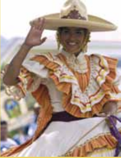
Left: Woman in traditional costume, Puerto Vallarta