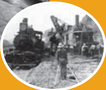
In oval: Building the Panama Canal