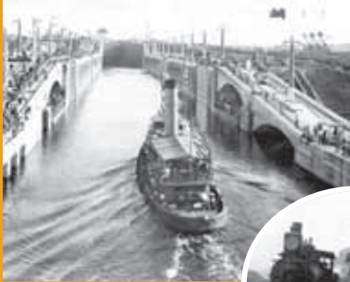
Left: Construction of canal locks, 1913