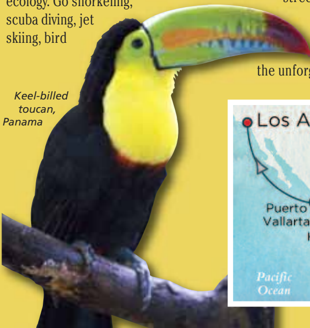
Keel-billed toucan, Panama

Located at the base of the Sierra Madre del Sur mountains, Huatulco is a peaceful resort town boasting white sand beaches, picturesque coves and turquoise bays. The area has long been known for its coffee, banana, papaya and coconut plantations, and the resort’s development was carefully undertaken to preserve the region’s ecology. Go snorkeling, scuba diving, jet skiing, bird