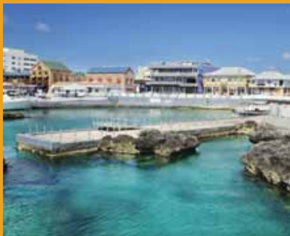
George Town, Grand Cayman

Contact us to ask about these special fares and to secure your air reservation.