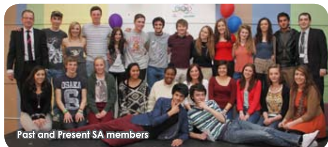
Past and Present SA members

Tuesday 12 February Tuesday 5 March Monday 11 - Thursday 14 March Thurs 14 - Wed 20 March Thursday 21 March 12.30 pm - Café Direct