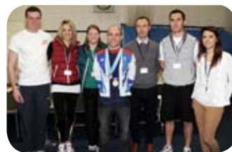
Peter Waterfield with members of the Sports Staff from the College