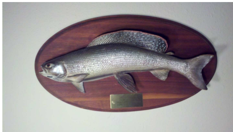
Beautiful Arctic Grayling caught on Nueltin Lake, Canada

Next day we decided to take a short hike around a shallow set of rapids up to a neighboring lake that was not as deep as Nueltin, but had a lot of northern pike. We spent