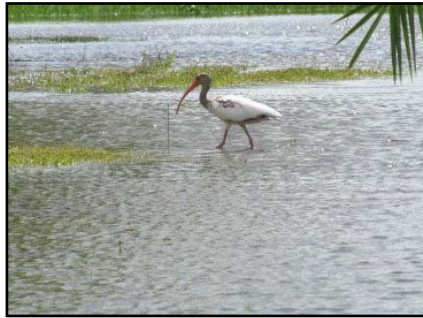
of an immature ibis in a flooded area of ECity after the effects of Tropical Storm Debby.

EVERGLADES CITY Lat: 25.87°N Long: 81.37°W see www.weather.gov for weather and www.nhc.noaa.gov for storms