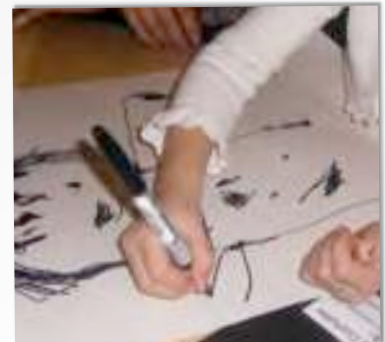
A TOUR OF TRIBECA COMMUNITY SCHOOL