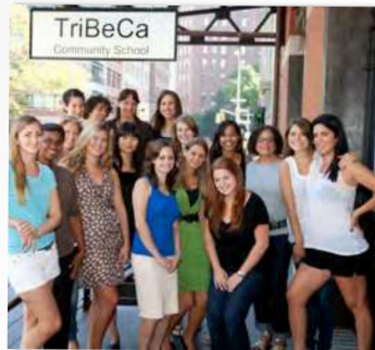
PRESENTATIONS AND HANDS ON EXPERIENCES WITH THE TRIBECA COMMUNITY SCHOOL STAFF