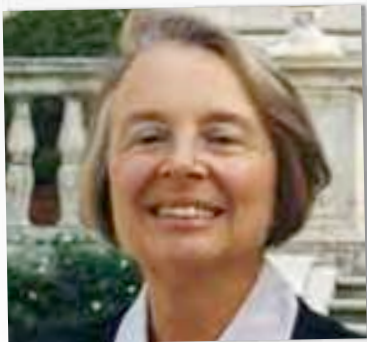
KEYNOTE PRESENTATION BY LELLA GANDINI