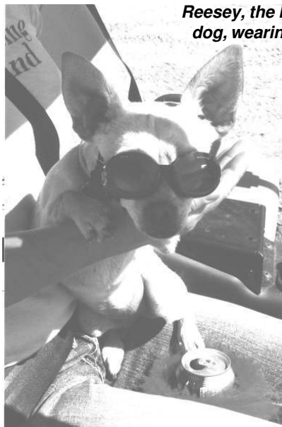
Reese, the Rhino riding dog, wearing doggles.