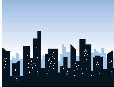
Your business logo