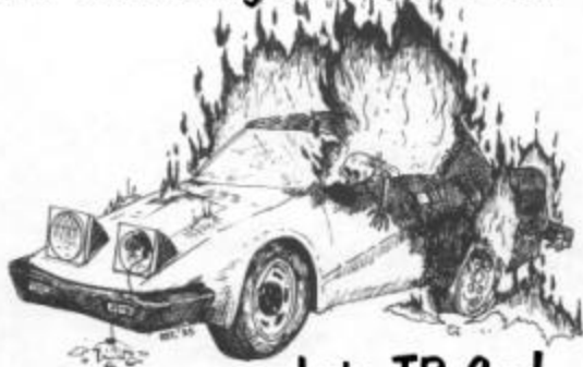
Late TR Guy!