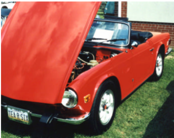
Good license plate.