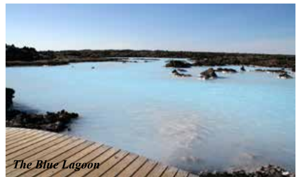
The Blue Lagoon

Take advantage also of optional tours for both traditional and offbeat attractions – including elf-spotting tours, Viking feasts, whale watching, horseback riding, lava fields, and a variety of sports and leisure activities. This Vassar alumni adventure offers the best of a guided tour plus time to explore on your own.