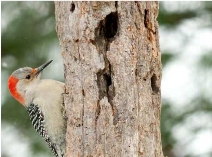
Female red-bellied woodpecker.

For more information contact John at (618)457-6367.