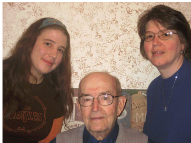
The picture was taken at a Thanksgiving Day family gathering, 2006.