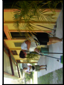
CASA KINDER is ready!