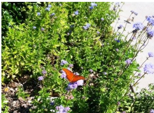
It's the time of year when the Monarch butterflies linger on the WPM flowers before migrating south.