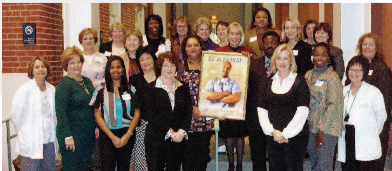
School of Nursing Students and Alumni Meet CCNE Accreditors

Recognized by the U.S. secretary of education, CCNE is the principal accrediting body for nursing schools and the only national accrediting agency devoted exclusively to evaluating bachelor's and graduate nursing education programs. The CCNE accreditation includes the RN to BSN/MSN program offered by Thomas Edison State College.