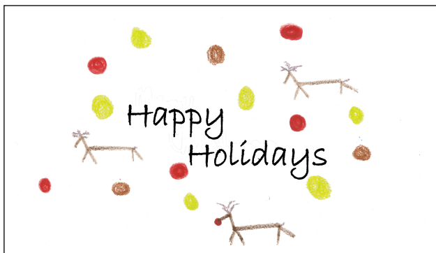
Fronts of card