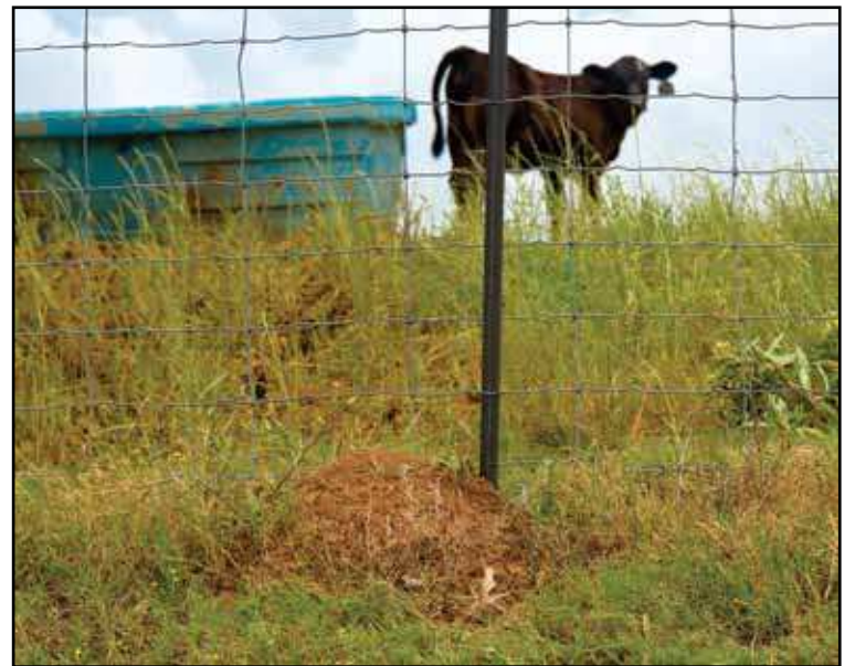
Fire ant mounds are common along fence lines where they are protected from grass-cutting equipment and other traffic, such as this mound in an Oktibbeha County, Mississippi, pasture on May 11, 2015.

For more information on controlling fire ants in pastures, hayfields and barnyards, go online to http://msucare.com/pubs/publications/p2493.pdf .