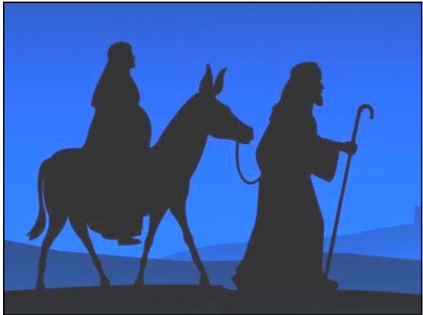
Joseph and Mary going to Bethlehem