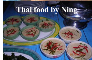
Thai food by Ning