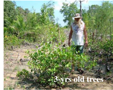
3-yrs old trees

During MAP visit at the project, children from Ban Talee Nok (an adjacent community) were invited to perform their puppet show related with mangrove conservation and other environmental issues.