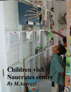
Children visit Naucrates centre By M.Aureggi

The sala built in 2005 by Naucrates in Tapayoi village was damaged by the strong and heavy rainy season. Naucrates together with Aiutare i Bambini gave financial support and repaired the roof. In addition, Naucrates centre was often visited by tourists, local visitors, other project members and school children.