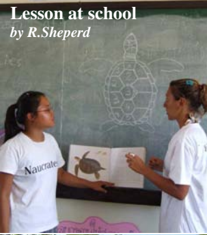
Lesson at school