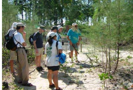
Visitors at the Mangrove Restoration Project