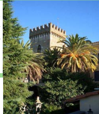
2008 Meeting location in Italy

The VII Naucrates Annual Meeting will be held in Italy, in Giulianello di Cori (LT), on Saturday 11 October at 15:00. More details on how to book the weekend in the Italian countryside with Naucrates friends can be found at www.naucrates.org