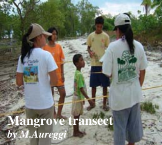
Mangrove transect by M.Aureggi

The sala built in 2005 by Naucrates in Tapayoi village was damaged by the strong and heavy rainy season. Naucrates together with Aiutare i Bambini gave financial support and repaired the roof. In addition, Naucrates centre was often visited by tourists, local visitors, other project members and school children.