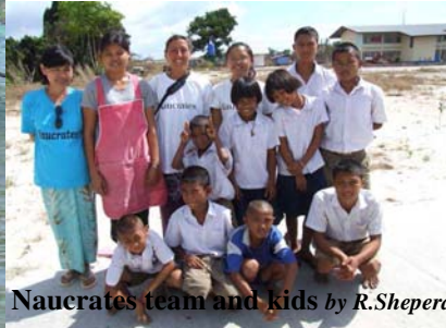
Naucrates team and kids