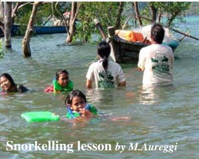
Snorkelling lesson