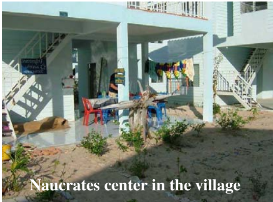
Naucrates center in the village