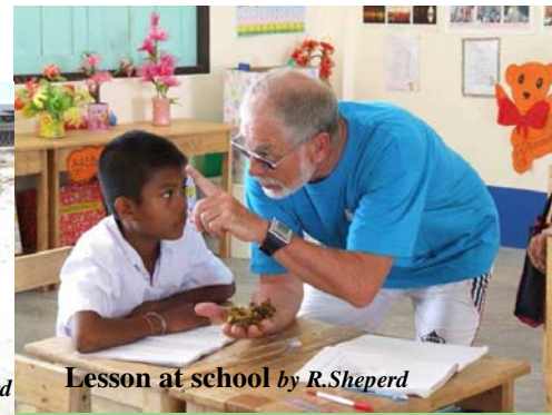
Lesson at school