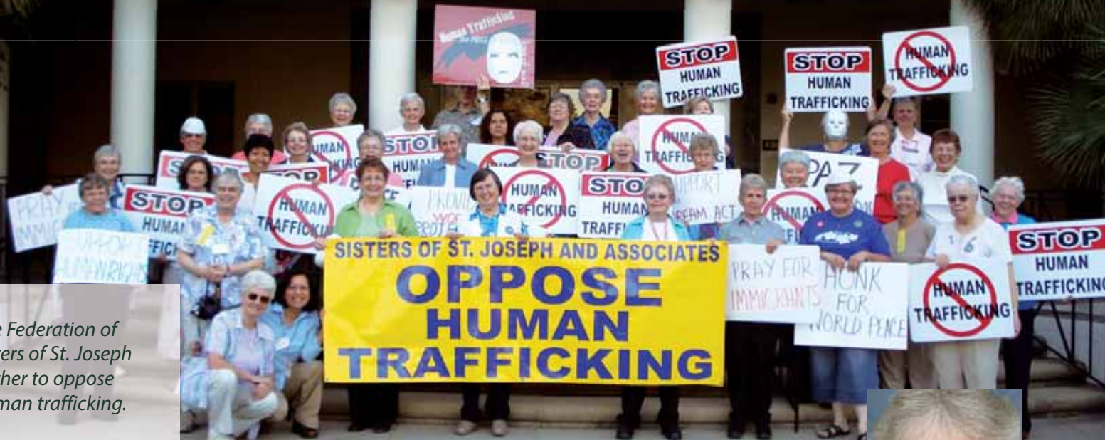
The Federation of Sisters of St. Joseph gather to oppose human trafficking.

Since our beginning, we Sisters of St. Joseph have been reading the signs of the times and acting for justice. We see this action as an essential part of our spirituality. Today we are speaking out against the horrors of modern-day slavery in the form of human trafficking.