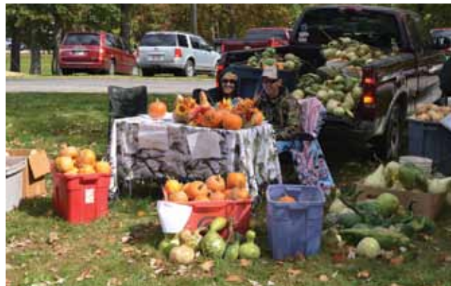
A perfect example of the bounty of farm fresh vegetables available that day.