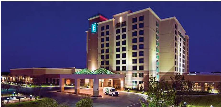
The Embassy Suites, Murfreesboro Hotel and Conference Center

This penalty will be the sole responsibility of the registrant and will be required at the time of check out.