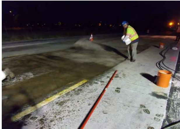
Figure 26. Top dressing wheel path inlay section.