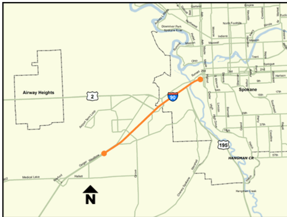
Figure 4. Vicinity map of Contract 8018, Vic Geiger RD to Spokane Viaduct.

The experimental application of PPC was included in Contract 8018, Vic Geiger Road to Spokane Viaduct on I-90 in Spokane (Figure 4). The contract called for the replacement of damaged panels and the diamond grinding of all lanes to remove rutting between Milepost 275.40 and Milepost 280.16. A very short portion of the project between MP 275.55 and 275.58 was selected for the experimental installation. The configuration of I-90 where the trial was to take place is two lanes in each direction. The average daily traffic for this section of I-90 is 33,254 with 13 percent trucks.