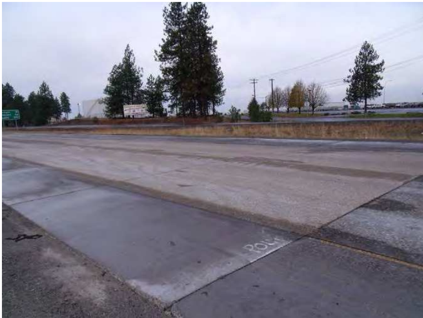
Figure 46. Full lane inlay section after diamond grinding.