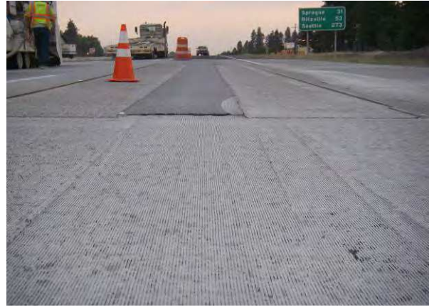
Figure 19. End view of wheel path inlay section from full lane inlay section.