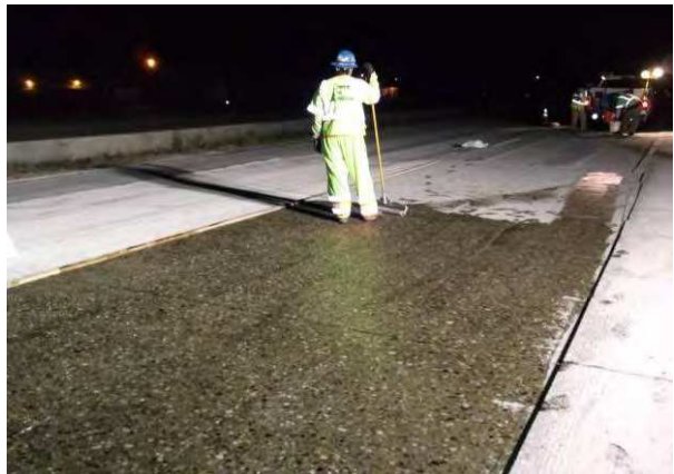
Figure 15. HMWM prime coat being applied. Wheel path inlay section is in the background