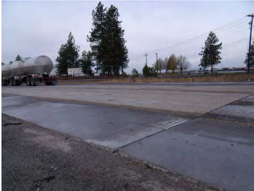
Figure 45. Full lane inlay section after diamond grinding.