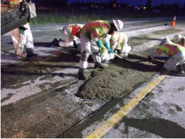
Figure 24. Spreading and striking off PPC in wheel path inlay section.