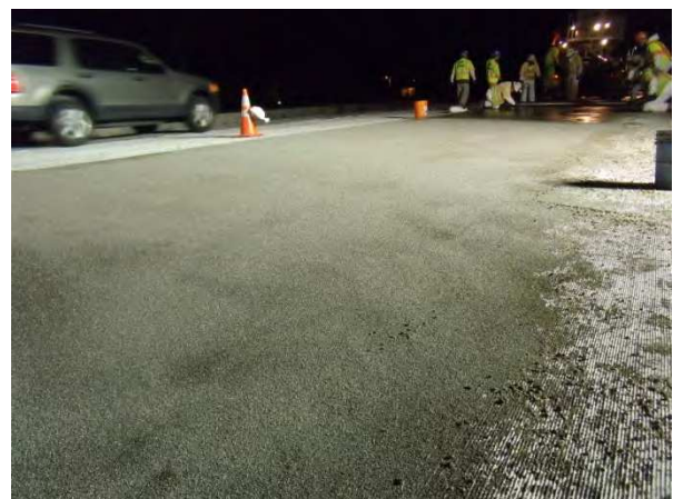
Figure 17. Finished PPC after top dressing with aggregate.