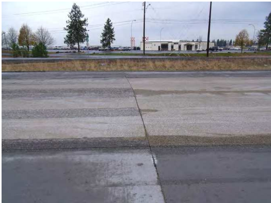
Figure 52. Wheel path inlay section after diamond grinding.