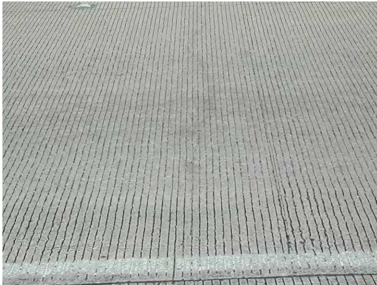
Figure 2. Concrete pavement on Interstate 45 in Houston, Texas after thirteen years of traffic.

section is 178,000 vehicles per day. Studded tires are legal in Texas, however, their mild climate does not typically warrant their use. The damaging effects of studded tires is clearly observable in this comparison which is made even more dramatic when considering that the Texas pavement has received more than 26 times the daily traffic volume (178,000 versus 6,800) and has been in service for almost twice the number of years (thirteen years versus seven years at the time of these photos) as the pavement on SR 395.