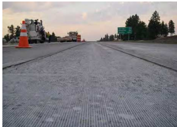
Figure 14. Full lane inlay section.