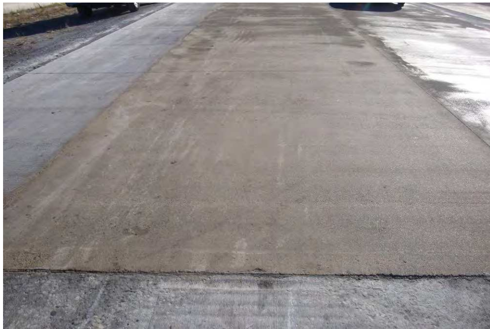
Figure 37. Close-up of the full lane section of PPC.