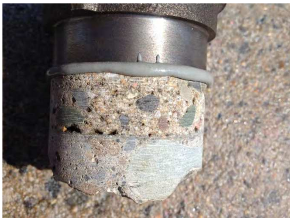
Figure 10. Pull off test 1.

Note: The Bridge Office special provisions require that the pull-off tests average 300 psi.