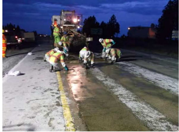
Figure 25. Final hand troweling of the wheel path inlay section.