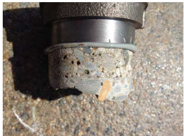
Figure 11. Pull off test 3.