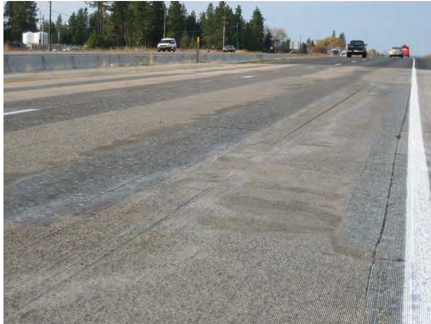
Figure 53. Wheel path inlay section after diamond grinding.