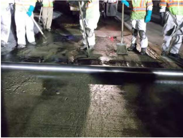
Figure 34. Distributing PPC in front of roller screed in rut fill section.