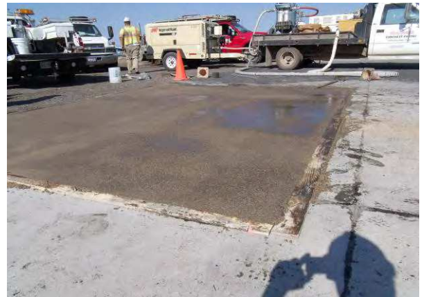
Figure 9. Finished trial application.

The special provisions also required pull-off tests to verify the bond between the PPC and the underlying pavement. A two inch diameter core drill was used to drill through the overlay and an inch into the existing concrete pavement. A steel cap was bonded to the overlay with epoxy. A hydraulic jack with a pressure gauge was attached to the steel cap and force was applied in a vertical direction to separate the overlay from the existing pavement. Failure in the concrete of the existing pavement is a passing test since the strength of the polyester overlay exceeded the strength of the existing pavement (Tests No. 1 and 3). Test No. 2 was also a passing test since the PPC did not fail. The average pull off stress for the three passing tests was 419 psi. A copy of the test results submitted on behalf of the Contractor by Budinger & Associates is available in Appendix E.