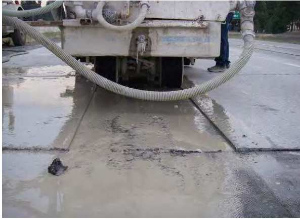
Figure 18. Diamond grinding wheel path inlay section.