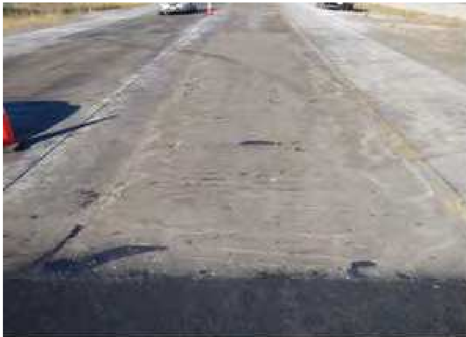
Figure 43. End view of rut fill section of PPC.