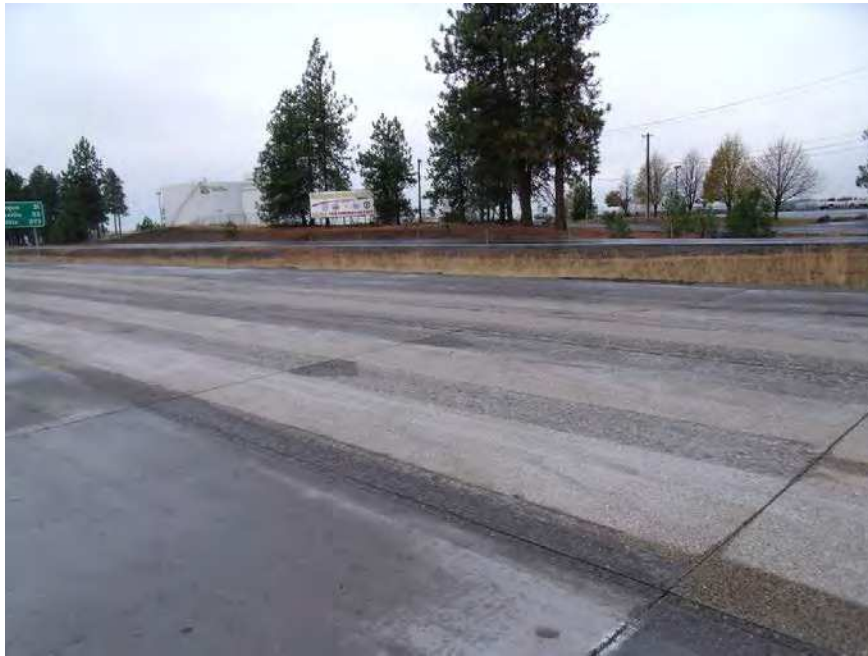
Figure 51. Wheel path inlay section after diamond grinding.