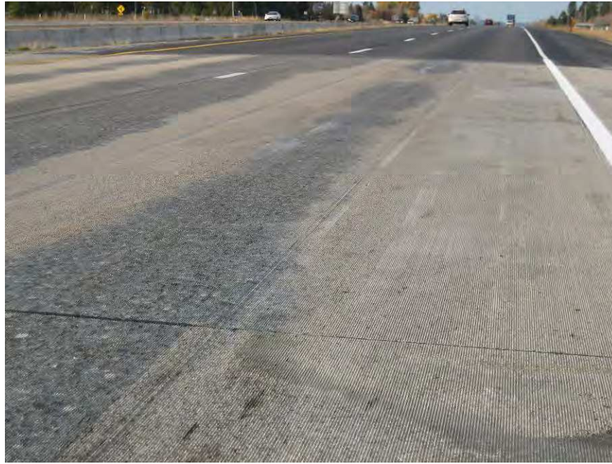
Figure 57. Rut fill section after diamond grinding