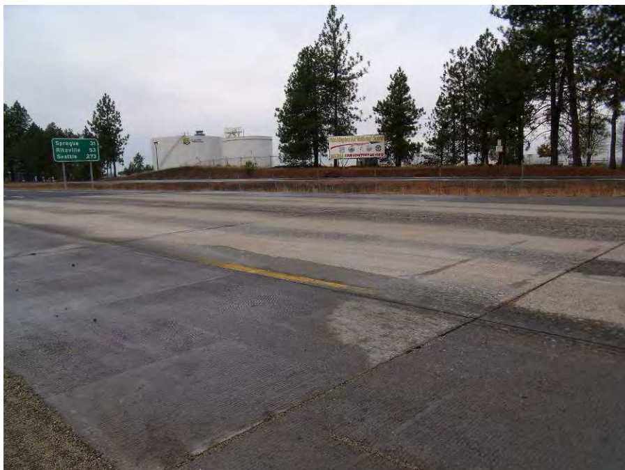
Figure 56. Rut fill section after diamond grinding.