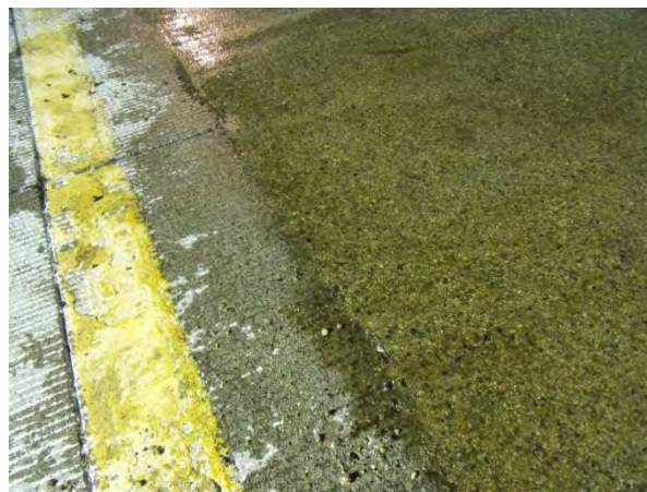
Figure 32. Close-up of finished PPC prior to top dressing with aggregate.