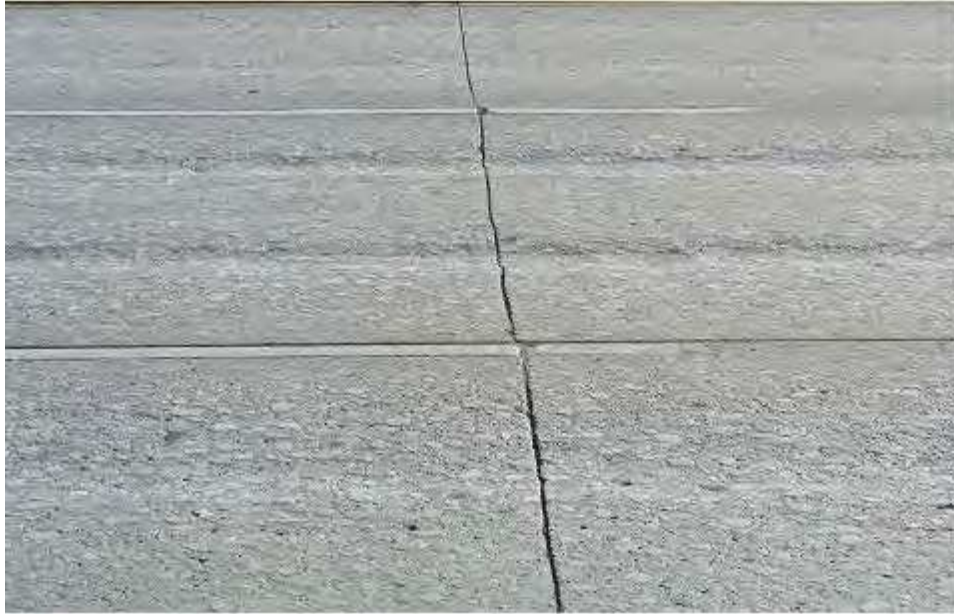
Figure 3. Studded tire wear on a concrete pavement (I-90 Spokane).