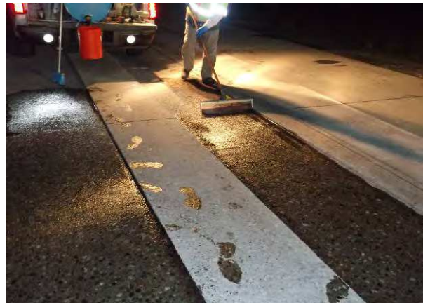
Figure 21. HMWM prime coat applied in wheel paths.