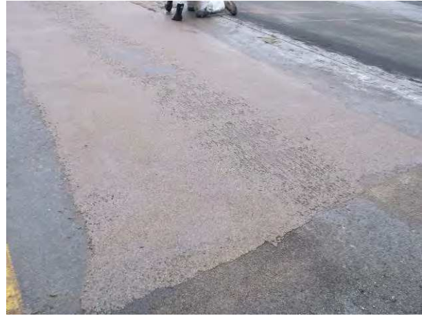
Figure 35. Finished rut fill section prior to application of top dressing.