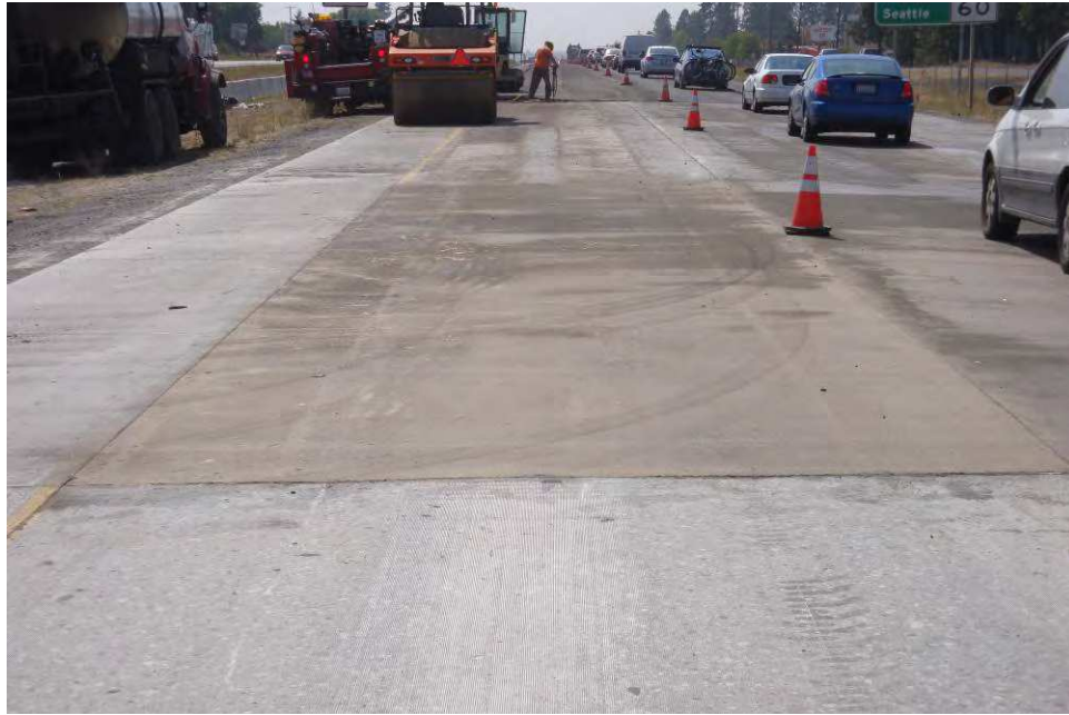
Figure 36. Both lanes of the full lane section of PPC.