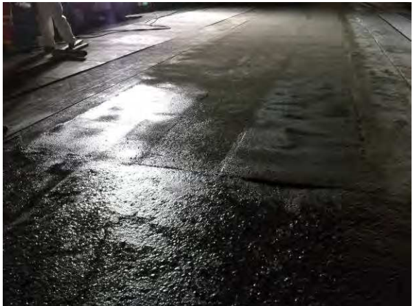
Figure 27. Finished wheel path section.