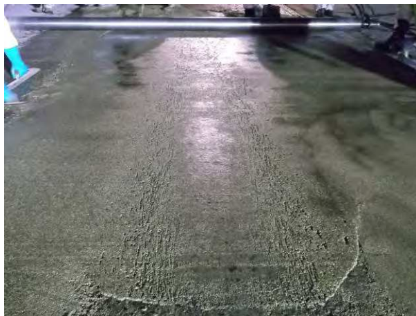
Figure 33. Finished PPC in the rut fill section.