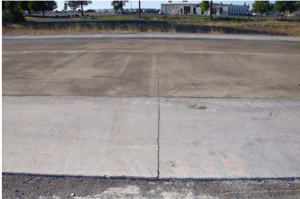
Figure 38. Side view of both lanes of the full lane section of PPC.