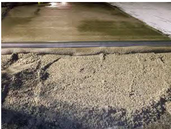
Figure 16. Roller screed finished PPC.