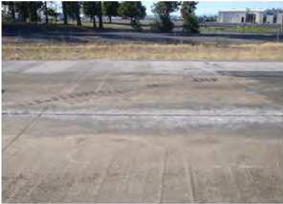
Figure 44. Side view of both lanes of the rut fill section of PPC.