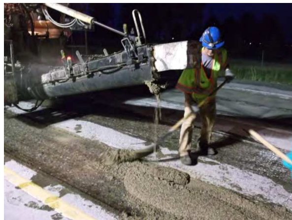
Figure 22. Placing PPC into wheel paths.