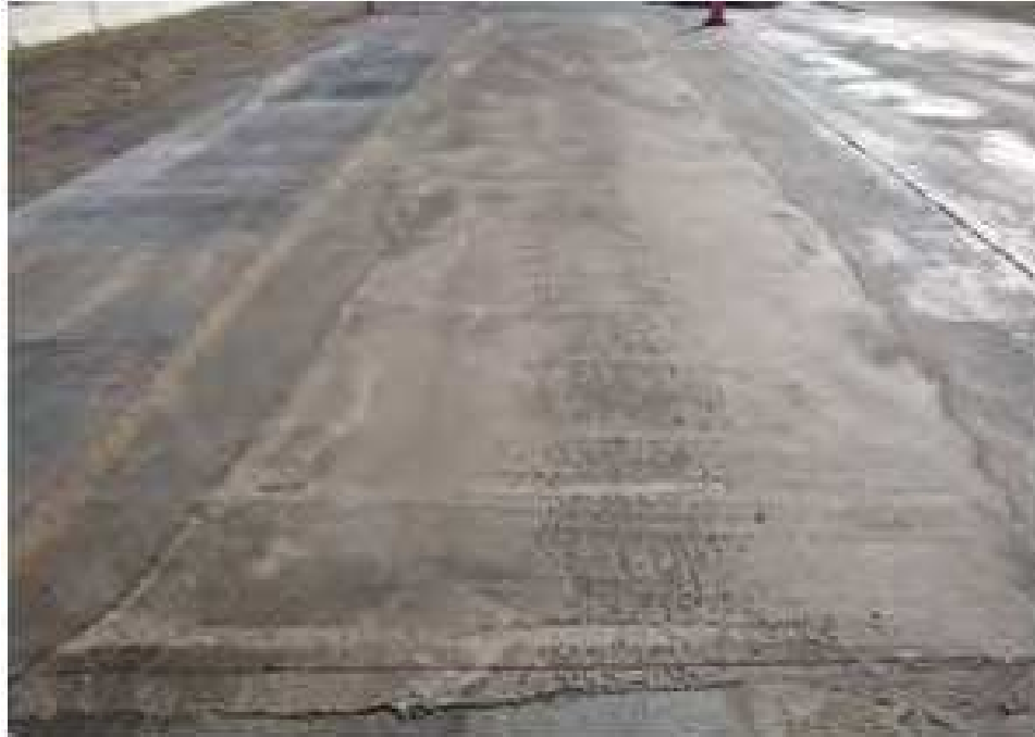
Figure 42. End view of rut fill section of PPC.