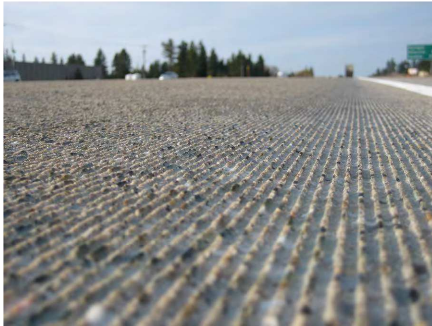
Figure 49. PPC texture of full lane inlay section after diamond grinding.