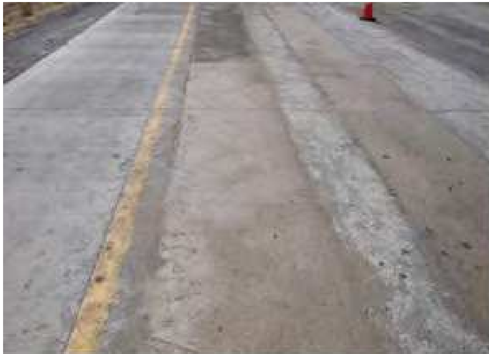
Figure 39. Close-up of wheel path inlay section of PPC.