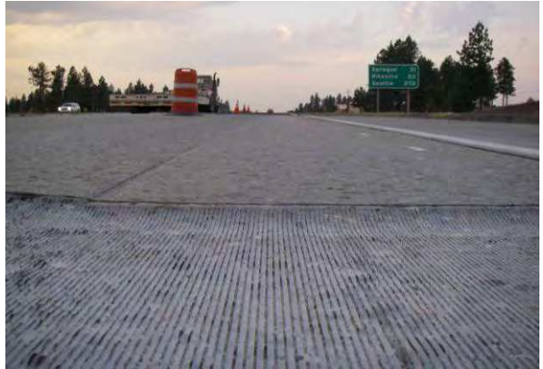
Figure 13. West end of full lane section.