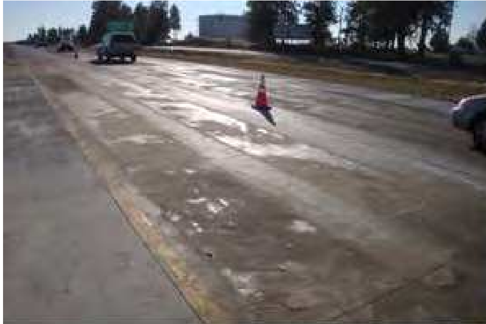
Figure 40. Wheel path inlay section of PPC.