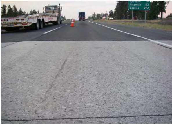
Figure 28. Rut fill section prior to overlay.