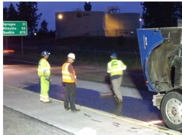
Figure 31. HMWM prime coat application.