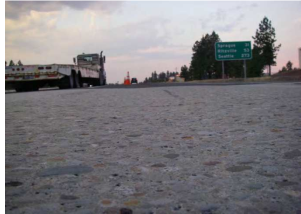
Figure 29. Close-up of rut fill section.