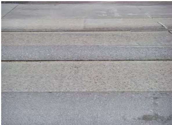
Figure 20. Side view of wheel path inlay section.