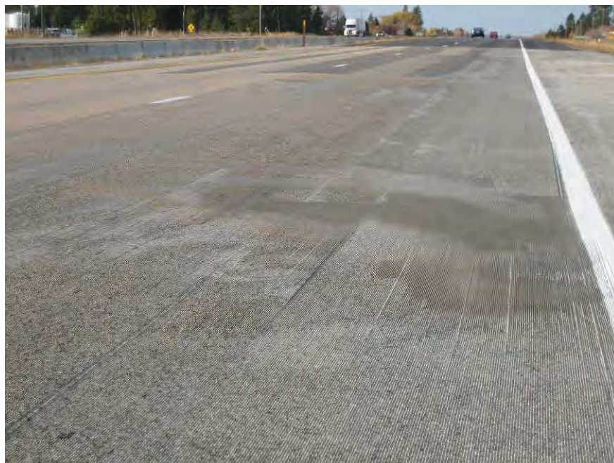
Figure 48. Full lane inlay section after diamond grinding in foreground, other sections in background.