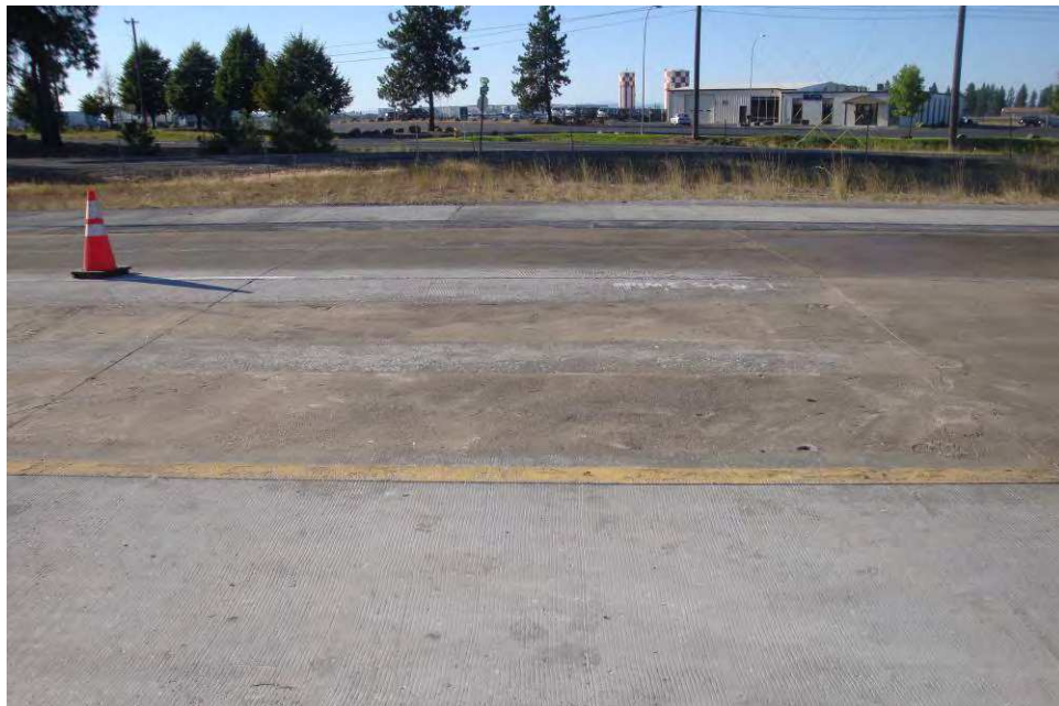
Figure 41. Side view of wheel path inlay section of PPC.