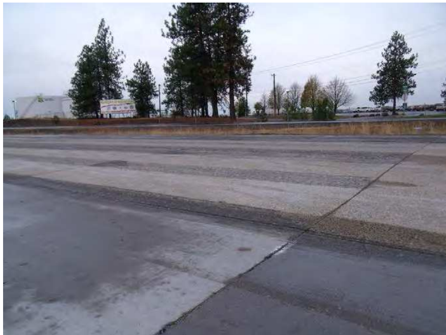
Figure 50. Wheel path inlay section after diamond grinding.