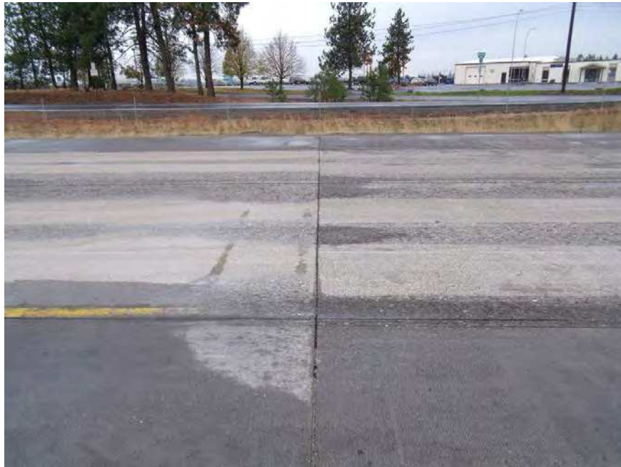
Figure 55. Rut fill section on the left, wheel path inlay section on the right after diamond grinding.