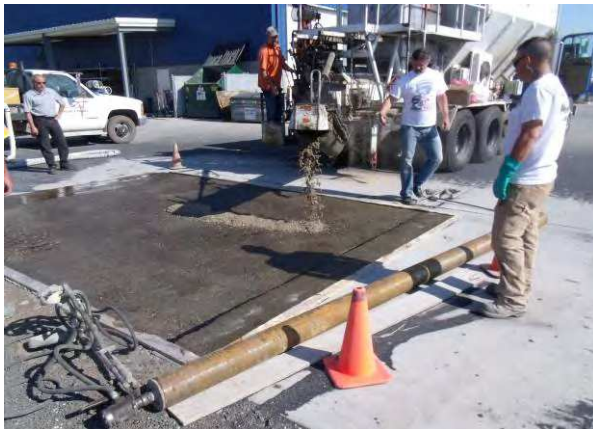
Figure 8. PPC being placed.