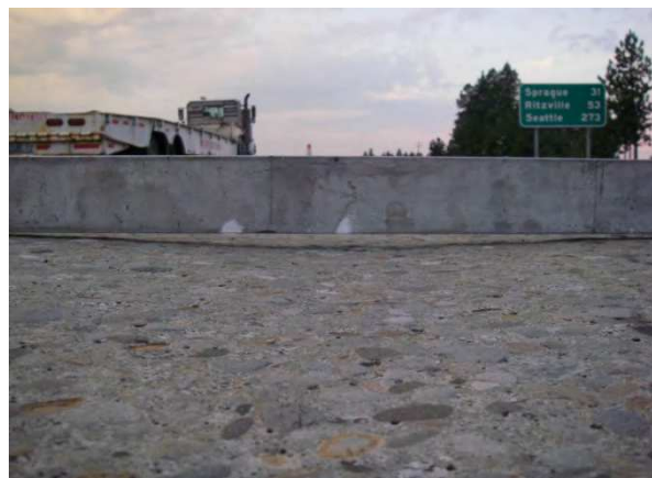
Figure 30. Amount of wear in rut fill section.