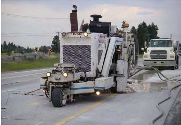
Figure 12. Diamond grinding machine.