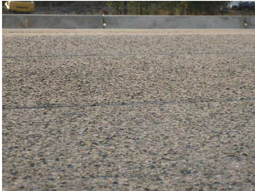
Figure 47. Close-up of full lane inlay section after diamond grinding.