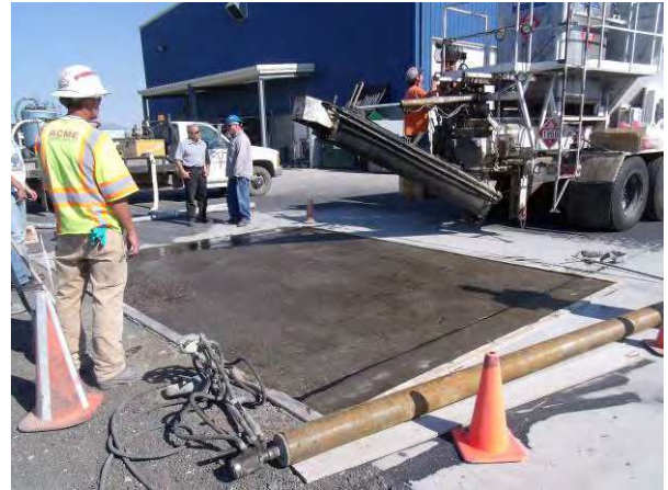
Figure 7. Mobile mixer moving into place to distribute PPC.