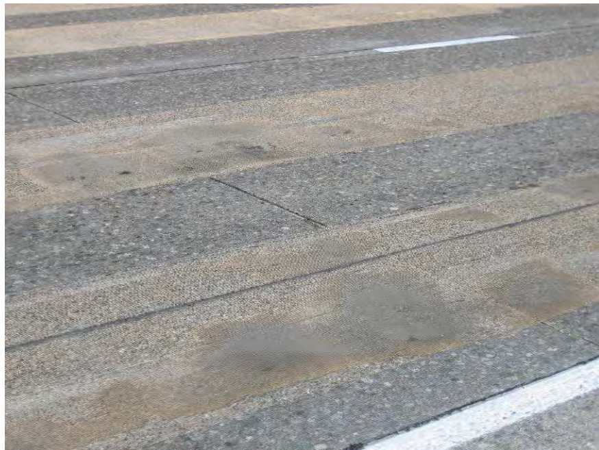
Figure 54. Close-up of wheel path inlay section after diamond grinding.