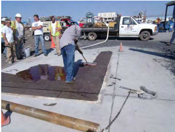
Figure 6. Rolling of high molecular weight methacrylate (HMWM) prime coat.