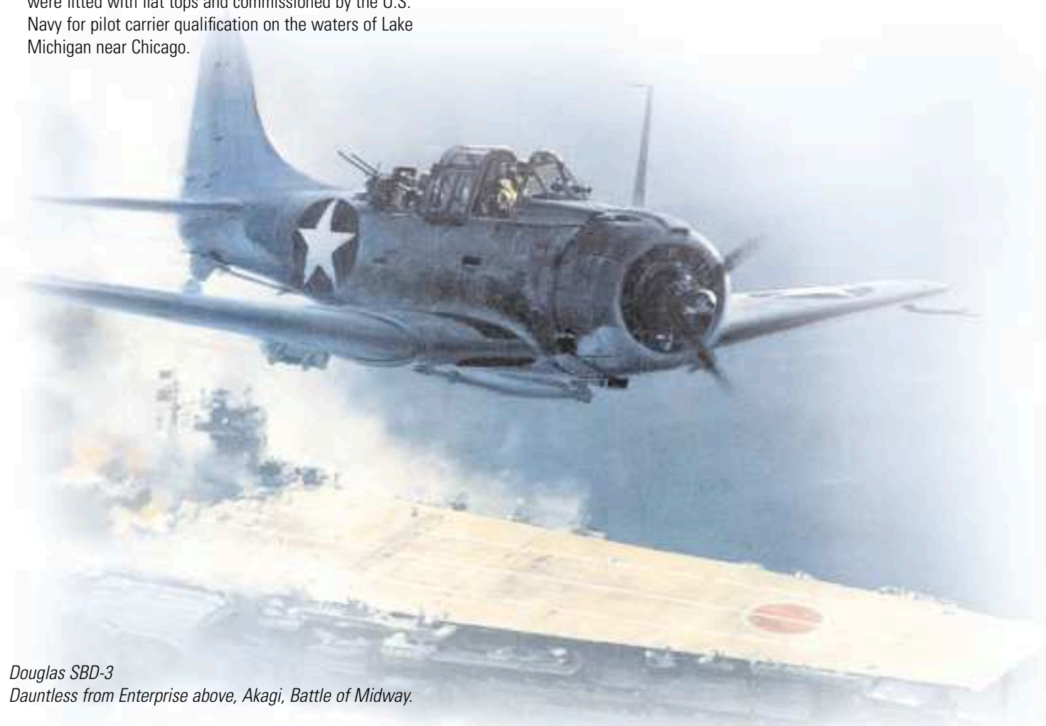
Douglas SBD-3 Dauntless from Enterprise above, Akagi, Battle of Midway.