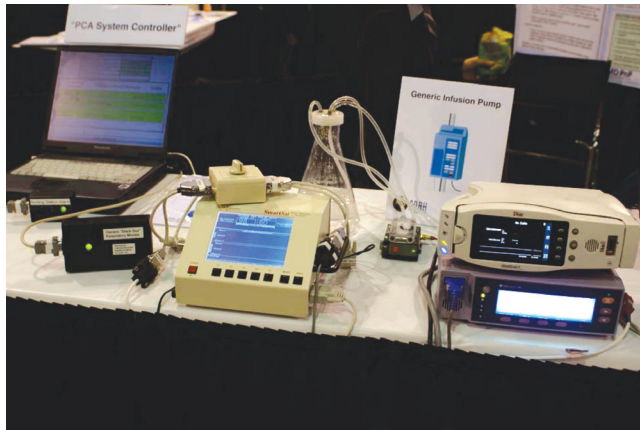
Figure 2. Case study setup.

dose to all treatment devices at a frequency of 1Hz. The PCA pump is a treatment device and it keeps on delivering treatment only as long as it periodically receives a go signal from the supervisor.