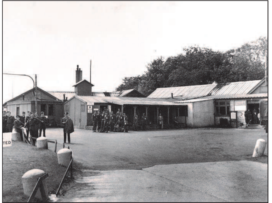
Air crews and other Army Air Force personnel waiting for transportation, Transient Air Transport Terminal, Preswick, Scotland, circa 1944-1945.

From my position on the floor I couldn't see out. I knew what was happening through other senses but not from sight. So when the engines stopped, I thought the braking would not be a problem, and we would stop before reaching the end of the runway. I sat there waiting, my back to the door into the bomb bay. I first knew we had a problem, a big one, when we ran off the pavement and into the rocks at the end. I couldn't see this, of course, but when the plane began rocking violently and the noise of strained and tortured aluminum became deafening it was apparent that we were totally out of control and crashing across the rock-strewn ground.