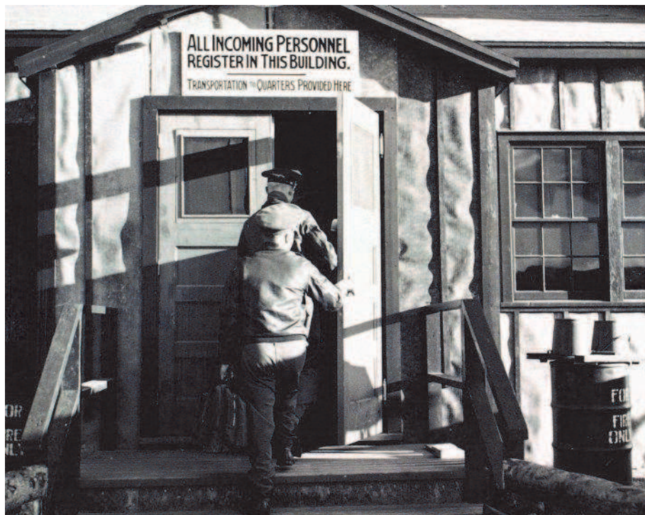
Incoming personnel processing area, Goose Bay, Labrador, circa 1944.

and a half hours, getting a nice high altitude tailwind boost.