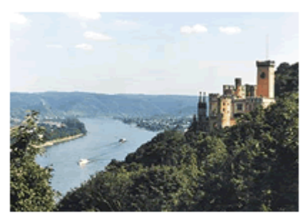
ROMANTIC CASTLES & GOLDEN VINES 8-day luxury cruise Rhine-Moselle Cruise on September 20th 2010

Tel: 011 367 0677 Fax: 0865 321 326 Email: info@easybuildza.com www.easybuildza.com