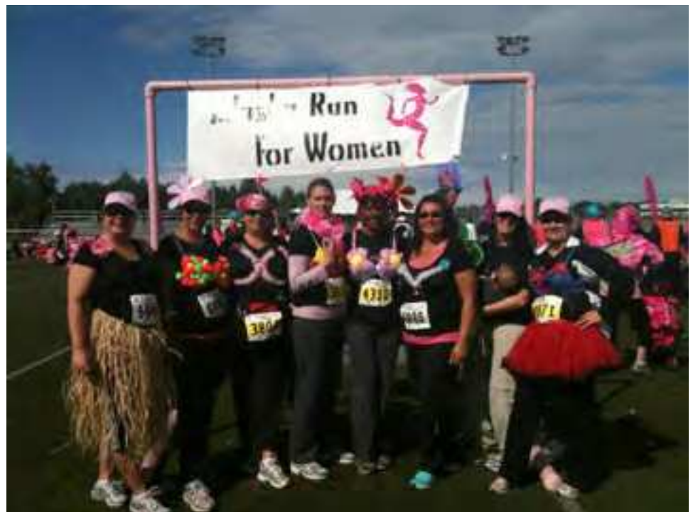
2012 Brewbies Run Team