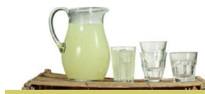
Hosting or Co-Hosting "Lemonade on the Lawn!"

► Lemonade on the Lawn! Please join us at 11:00am on the church lawn for refreshments and fellowship. All are welcome! We thank the members of the Stewardship committee for hosting Lemonade on the Lawn this morning. *See below for details on how you can become a part of this very important ministry.