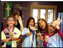
"Fun in Sunday School!"

► Celebrating Children in Worship! On the first Sunday of each month, children who have completed grades Kindergarten and above will remain in worship with their families. Worship bags (crayons, bookmarks, paper, etc.) and children's bulletins will be available at each entrance to the Sanctuary and Commons. (On these first Sundays each month, childcare for infants and toddlers and Sunday School for Preschool ages only, will be available.